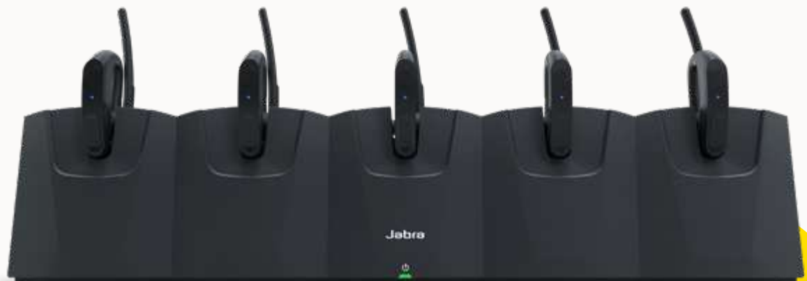
PERFORM CHARGING STAND, 5-BAY**

That's what we call a multi-tasking time-saver.